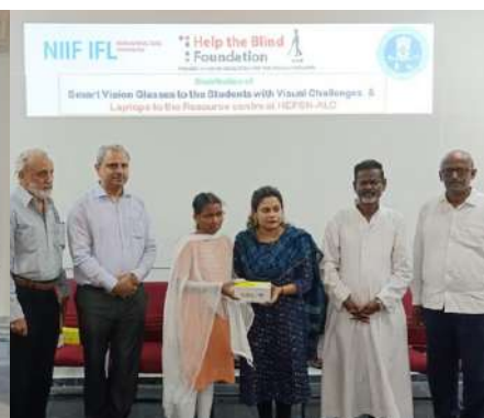
Snapshots from the event involving the distribution of SVGs at Andhra College, Vijayawada, on April 23rd 2024