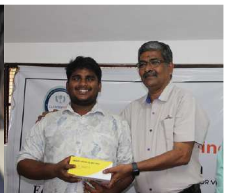
Snapshots from the event involving the Distribution of Laptops, Keyboards and OTG at Madras Christian College, Chennai, on April 22nd 2024